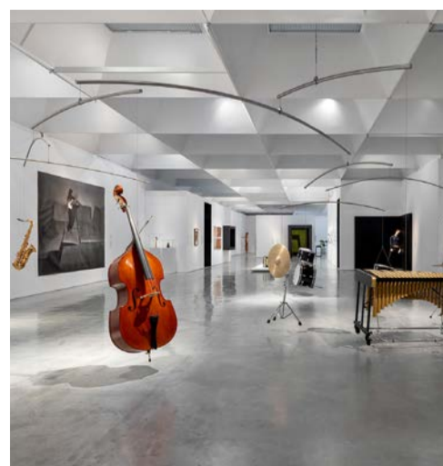
From the exhibition Overtones: Sound and Art.

Based on an English-language interview given by Yitzhak Rabin a year before his assassination, this sound installation evokes a Greek tragic chorus, summoning ghosts of the past, resonating with the present, and presenting a warning for the future.