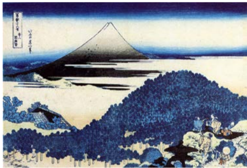
Hokusai Katsushika, The big cushion pine tree in Aoyama, Japan, ca. 1830–32 . The Jacob Pins collection in the Israel Museum.

Across media and geography, artists have been drawn to the transient conditions of vision. From Chinese and Japanese printmaking and painting to European and American painting and photography, the exhibition explores change, memory, and the poetics of ephemerality.